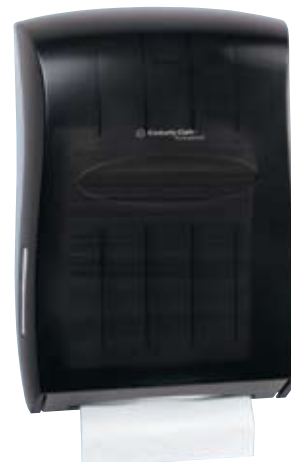
Dispenses SCOTTFOLD® towels.