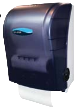
The simple handsfree dispenser.